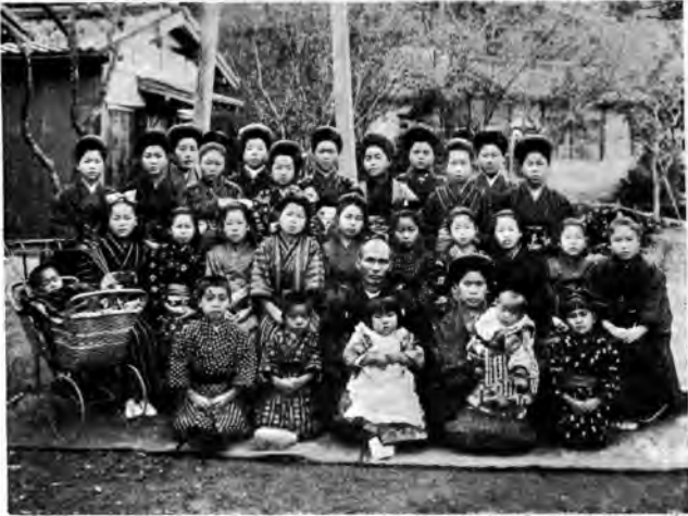
MATSUYAMA WORKING GIRLS' HOME GIRLS IN THE MATSUYAMA HOME